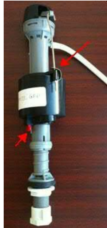
How to adjust tank water level (Figure 2)