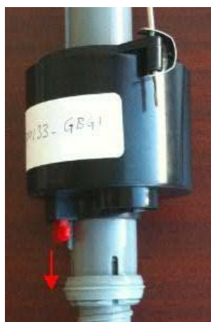
Pull down red lock nut (Figure 3)