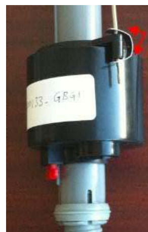
Squeeze the metal clip (Figure 4)