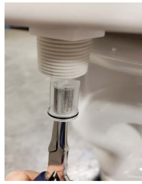
Step 4 – Check filter for debris. If debris is found clean out filter and wipe out the inside of the shaft to remove debris.

Below is an example of filter and shaft with debris